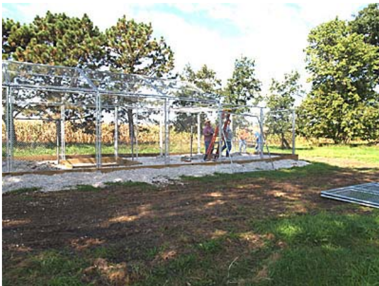
Pheasant pen under construction at hunting property before the start of the hunting season.