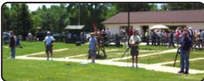
ATA Shoot In Full Swing