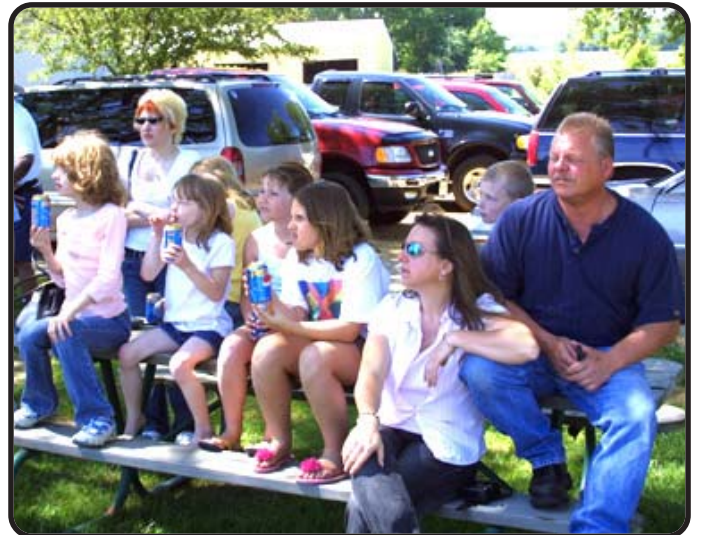
Future ATA Shooters?