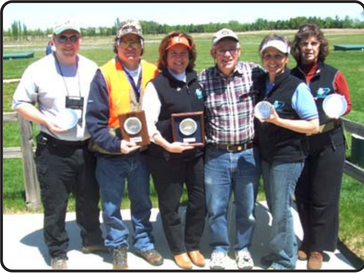
Winners in ATA Novice Shoot