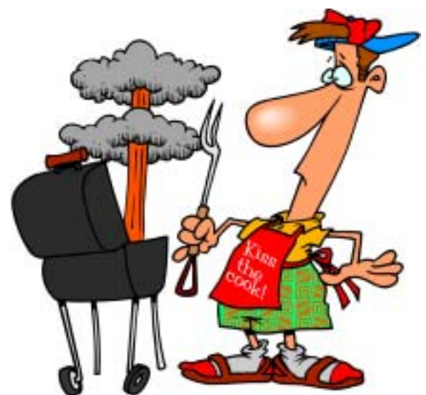
Happy Father's Day June 18, 2006