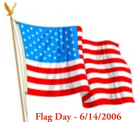
Flag Day - 6/14/2006

WANTED: Used 3-Phase Rotary Converter for Automotive Lift. Static Converter did not do the job. Call Bill Hardt 630-420-8799